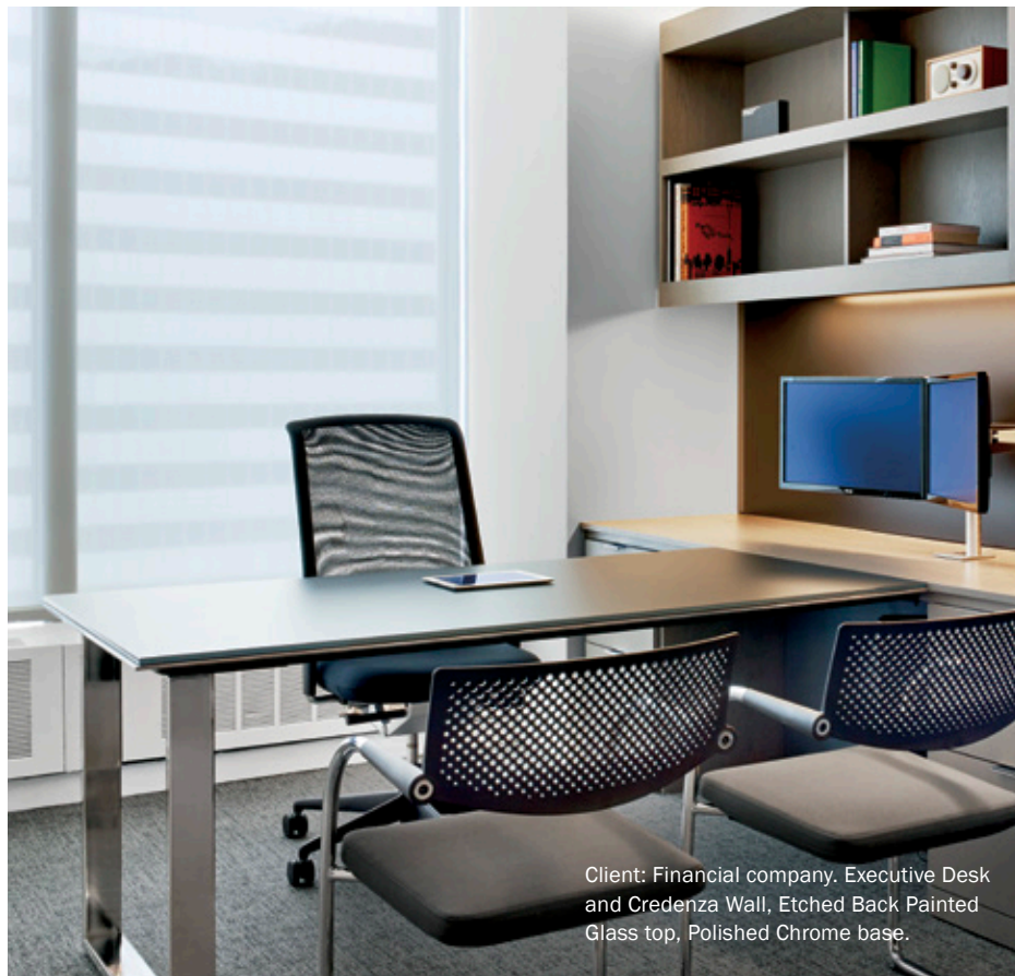
Client: Financial company. Executive Desk and Credenza Wall, Etched Back Painted Glass top, Polished Chrome base.