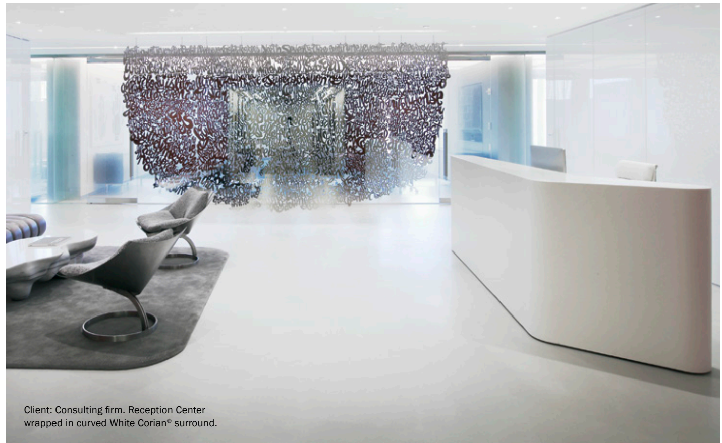
Client: Consulting firm. Reception Center wrapped in curved White Corian® surround.