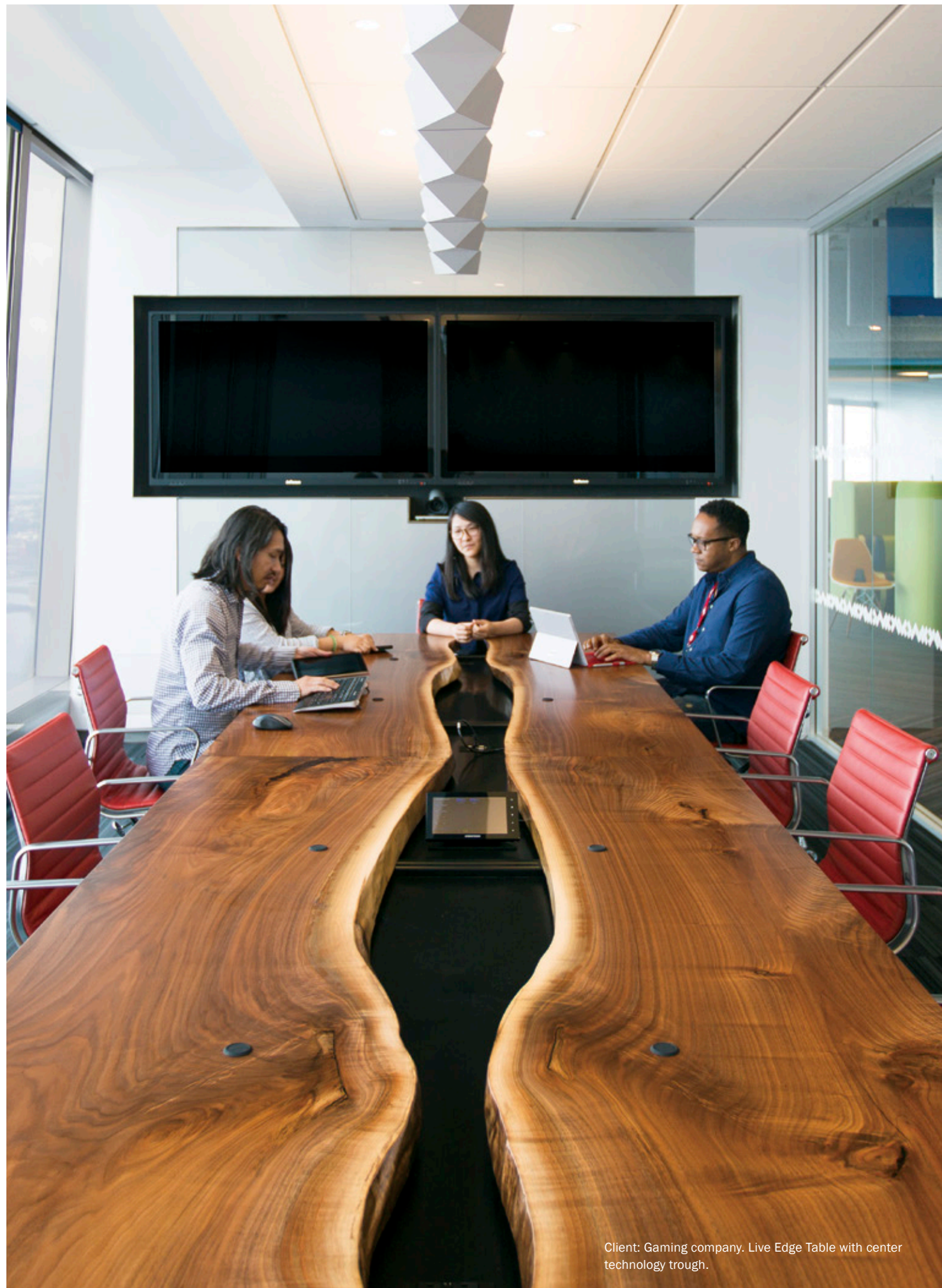
Client: Gaming company. Live Edge Table with center technology trough.